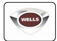
Ventless Hood Systems