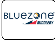
Air Filtration | Air Purification