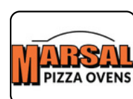
Deck Ovens | Pizza Ovens