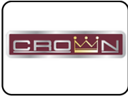
Steam Kettles | Tilt Skillets