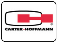
Insulated Food Transportation