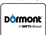
Gas Connectors | Hoses